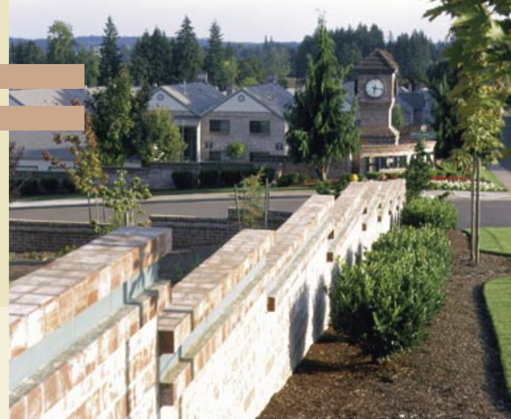
Above and Cover Photo: The Highlands - Tigard, Oregon

D evelopers who routinely use masonry fences and entries enjoy the benefits of shorter market time, higher margins, and that image of quality.