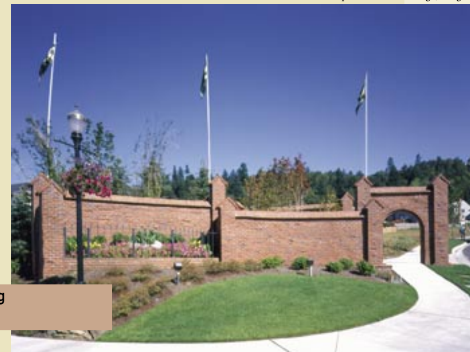
Marylhurst - Lake Oswego, Oregon

H ome buyers of the nineties demand quality, security and value in their homes and neighborhoods. Masonry offers all this and more.