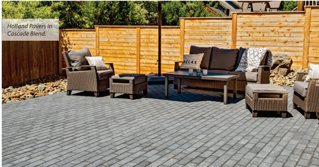
Holland Pavers in Cascade Blend.

Holland pavers offer a simple brick shape combined with the renowned durability of interlocking concrete pavers. Holland pavers are capable of meeting the demands of both architects and engineers for a beautiful, yet durable paving surface. Mutual offers the classic rectangular Holland shape, along with a Double and Triple Holland for increased design flexibility.