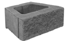
Flat Face Tapered Cap Unit † 3" x 18" x 13" (7.6 cm x 45.7 cm x 33 cm)