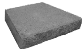
Coping Unit † 3" x 23 3/8" x 12" (7.6 cm x 60 cm x 33 cm)