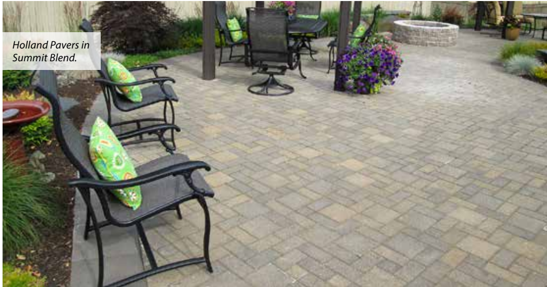
Holland Pavers in Summit Blend.

Holland pavers offer a simple brick shape combined with the renowned durability of interlocking concrete pavers. Holland pavers are capable of meeting the demands of both architects and engineers for a beautiful, yet durable paving surface. Mutual offers the classic rectangular Holland shape, along with a Double and Triple Holland for increased design flexibility.