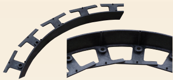
Snip 'n Flex One Piece System