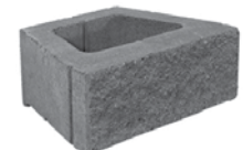
Flat Face Tapered Cap Unit 5 18" (front face) 12" (back face) x 3" x 13" (45.7 cm x 7.6 cm x 33 cm)