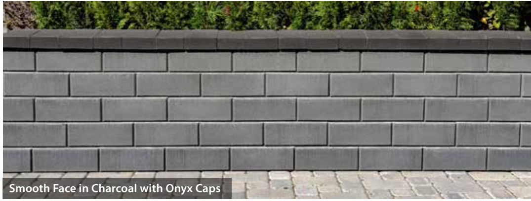
Smooth Face in Charcoal with Onyx Caps

ManorStone® Elite retaining wall blocks feature a hollow middle, reducing the weight per block by 30% compared to traditional non-hollow retaining wall blocks. Our lighter-weight blocks require less energy to lift which can help you save on labor costs and project build time.