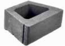
Smooth Face Tapered Sides 16" x 6" x 12" (15.2 cm x 40.6 cm x 30.5 cm)