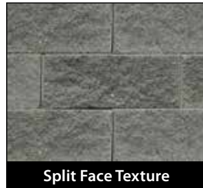
Split Face Texture