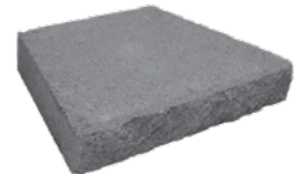
Split Face Tapered Cap Unit 18" (front face) 12" (back face) x 3" x 13" (45.7 cm x 7.6 cm x 33 cm)